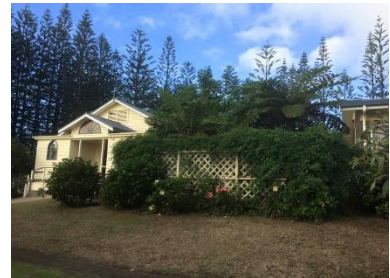
St Philip Howard Catholic Church, Norfolk Island

I write this from the presbytery of the cathedral's sister-parish on Norfolk Island, 1600km north-east of Sydney, where I am engaged in a few days of Covid-delayed pastoral activity. It is lovely to be back with the small Catholic community here.