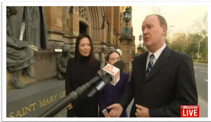
The Duffy Family being interviewed