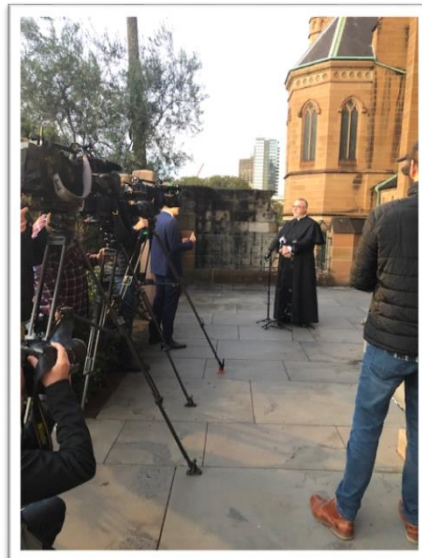
Photo: a small congregation of Media also awaited me very early this morning.

While it is good that we can open the cathedral now for Mass, confessions and private prayer, there is a strict limit on the number of people permitted in the congregation: ten only! And we are required by the current Public Health Order to keep the name and contact details of everyone who comes in, so that in the event of someone who has been here contracting the COVID-19 illness, the others who were here at the same time can be contacted.