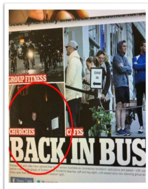
Making front-page news!