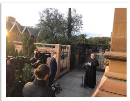
Being interviewed by Channel 10 News