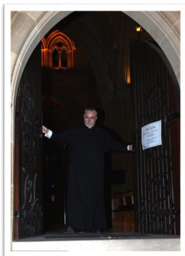
Official opening of the doors!