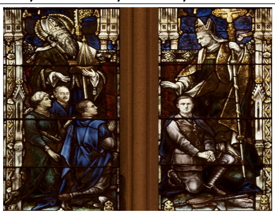
Memorial Window to 2<sup>nd</sup> Lieutenant Brendan Lane Mullins (killed in action 1917) and Lieutenant Colonel Ignatius Bertram Norris (killed in action 1916), in St Mary's Cathedral, Sydney